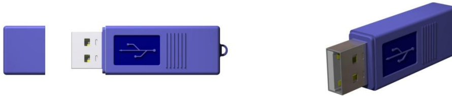
Figure 2.1 FTDI USB Key Illustration.

The following illustration, Figure 2.1 , shows a representation of the FTDI USB Key unit. The user interface is described below.