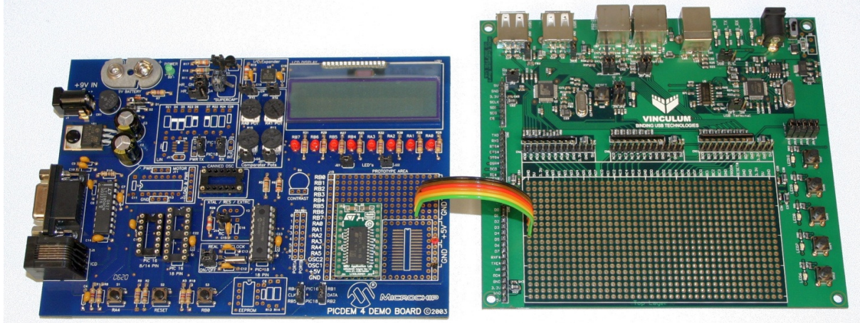
Figure 3.1 VLogger Application Demo Hardware

On the PICDEM 4 board a PIC18F1320 microcontroller is needed to run the provided code.