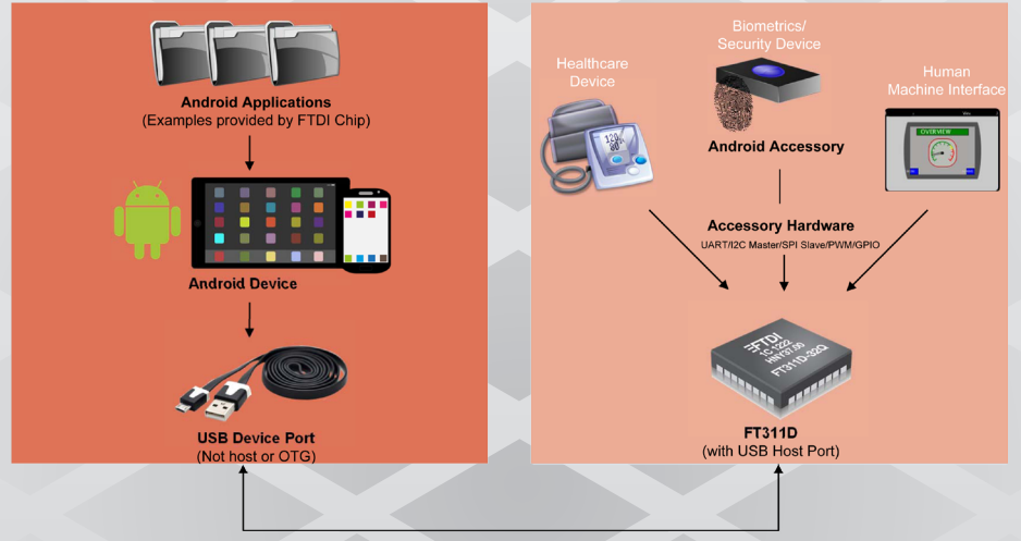
USB Connection providing data connectivity (Optionally, the Android Accessory can also charge the Android device)

The FT313H offers a fast rate of data transfer at 480Mpbs. The device interfaces a single USB channel to a parallel bus, with DMA engine for optimized data transfer. The device also supports battery charge host emulation.